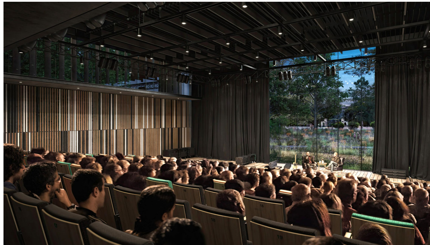
BLINDED BY THE LIGHT A 240-seat, state-of-the-art, Dolby Atmos-certified theater will double as a performance and event space.

And then at the same time, we can take on tough subjects and delve into them pretty seriously....As far as the boundaries of the music that the band can