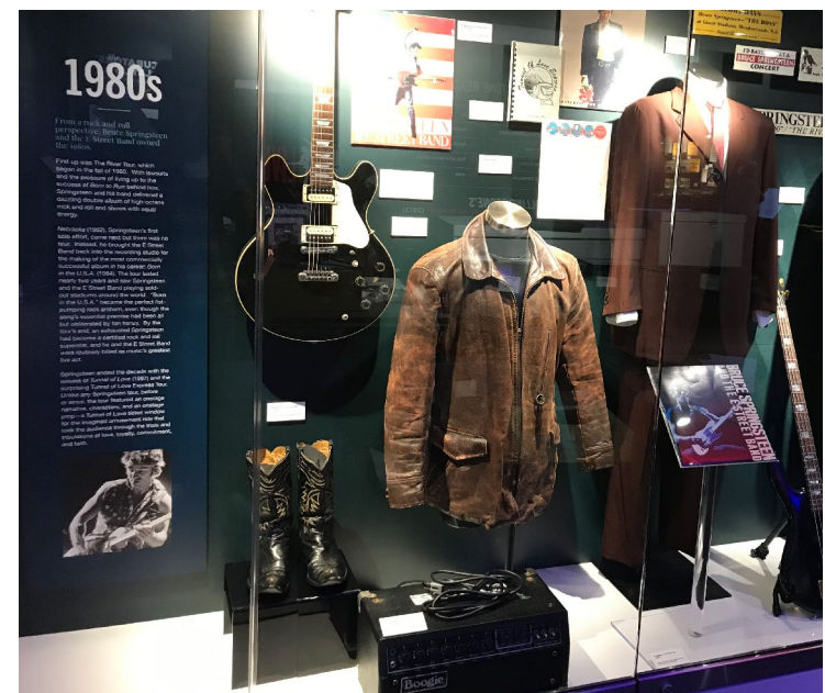
BORN IN THE U.S.A. The Springsteen Center celebrates not just Bruce and the E Street Band but music across American history. At left, the center’s national traveling exhibit, “Music America: Iconic Objects from America’s Music History,” is currently on view in Boston.