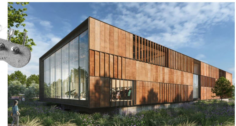
LONG WALK HOME The new Bruce Springsteen Center for American Music opens June 7 at Monmouth University in West Long Branch.

A t first glance, the striking new $50 million, 30,000-square-foot Bruce Springsteen Center for American Music, its immense glass windows glinting on a corner of Monmouth University's West Long Branch campus, might not immediately conjure its namesake New Jerseyan. Is it a match for the onstage presence of a world-class rocker-slash-preacher