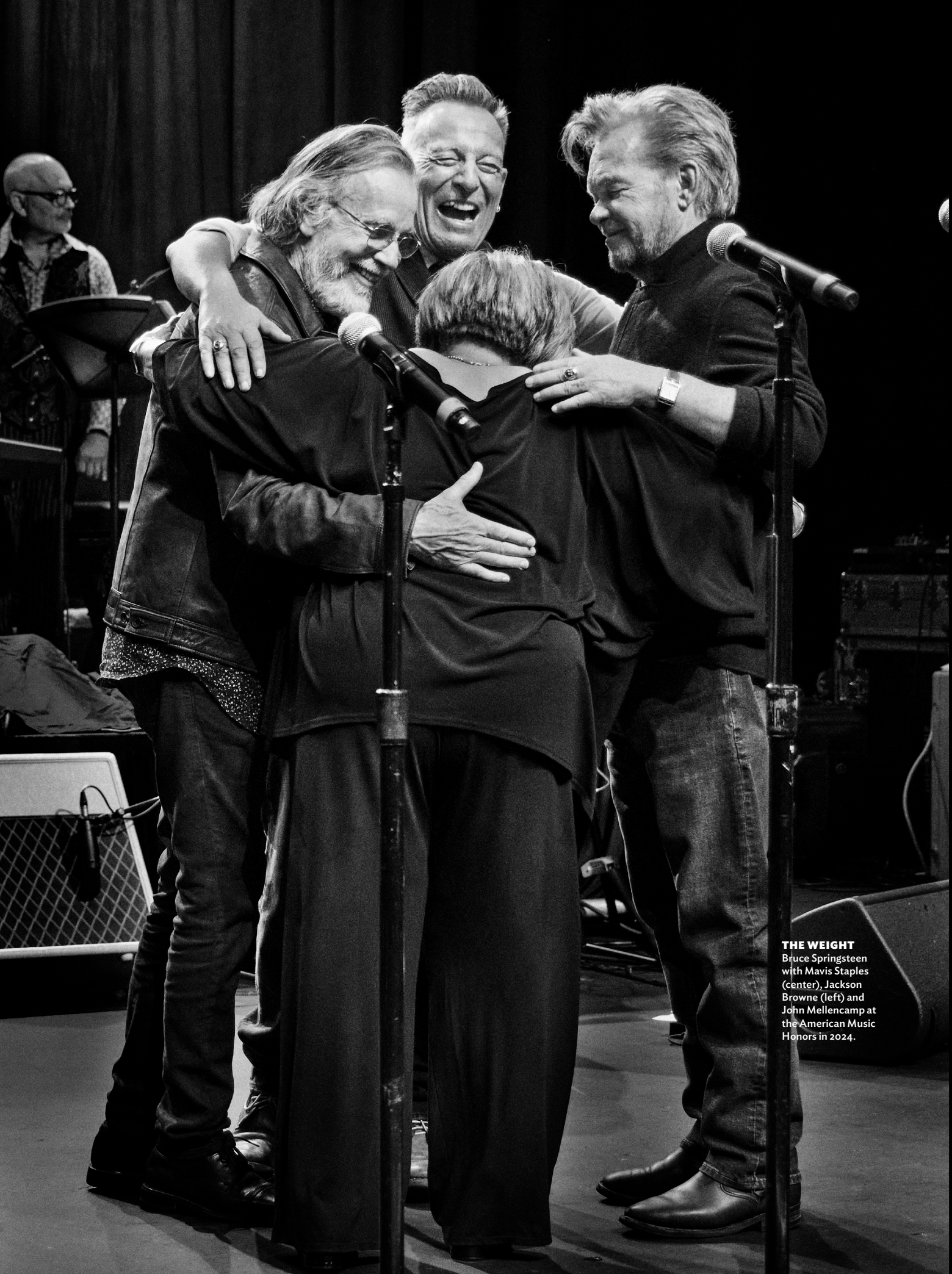
THE WEIGHT Bruce Springsteen with Mavis Staples (center), Jackson Browne (left) and John Mellencamp at the American Music Honors in 2024.